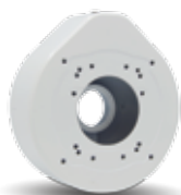
Junction Box (PR-B47JB) is available